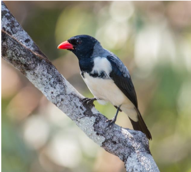
Red-billed Pied Tanager ( Lamprospiza melanoleuca )