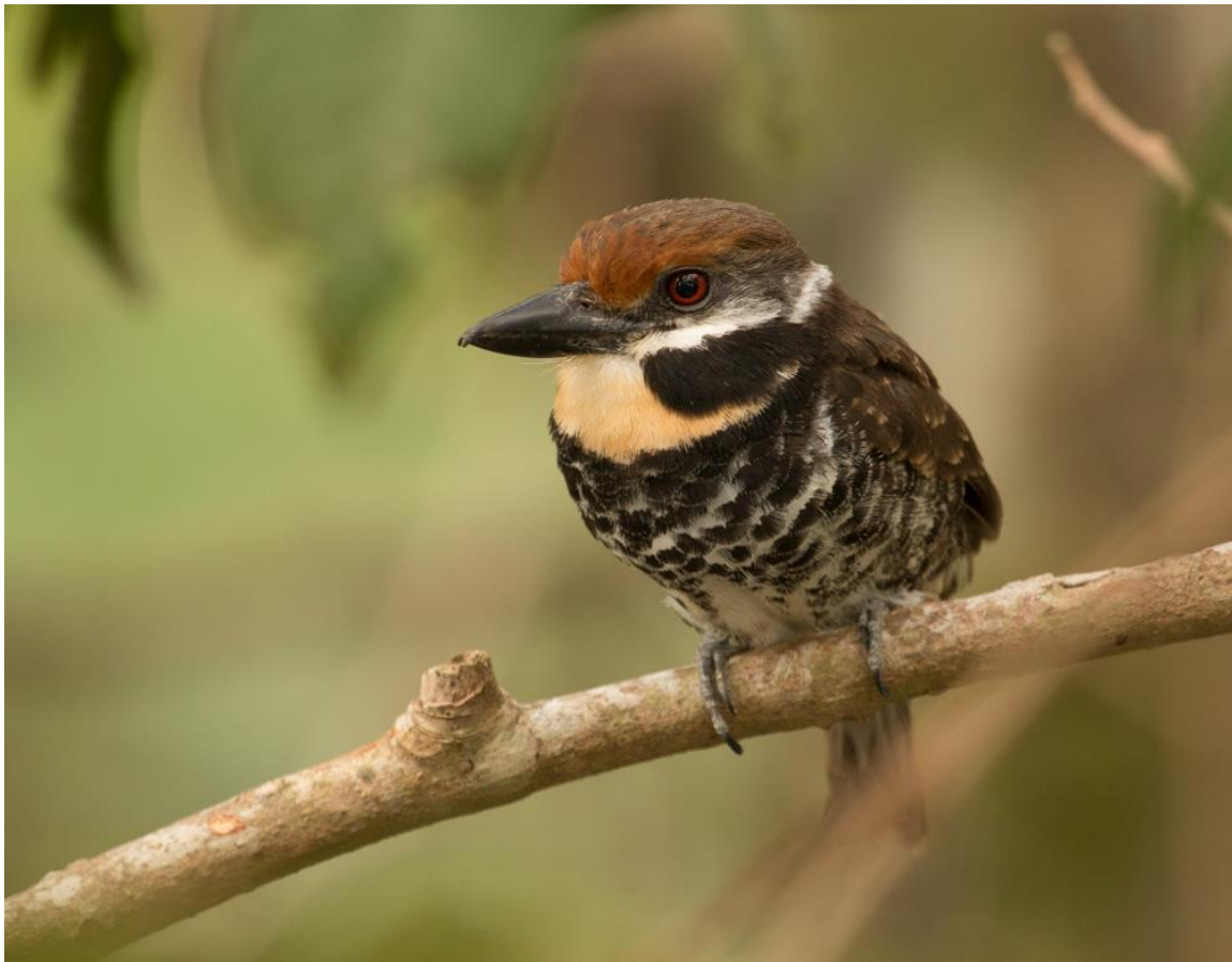
Spotted Puffbird ( Bucco tamatia )