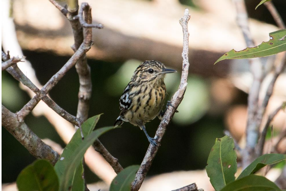
Cherrie's Antwren ( Myrmotherula cherriei )

river did not produce the desired Slender-billed Kite, but we did find some dapper White-throated Kingbirds, a few Orange-fronted Yellow-Finches, Black-collared Hawk, Tui Parakeet, Spotted Tody-Flycatcher, and a host of widespread water birds. With the skies darkening as heavy clouds gathered, we tried to outrun the rain and continue on to Novo Airão, but we did cross paths with a couple of very heavy rainstorms en route. We arrived in the late afternoon at our pleasant hotel on the outskirts of the small town of Novo Airão, our base for the next three nights to explore the Anavilhanas river island archipelago in the rio Negro.