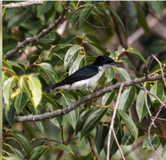
Glossy-backed Becard ( Pachyramphus surinamus )